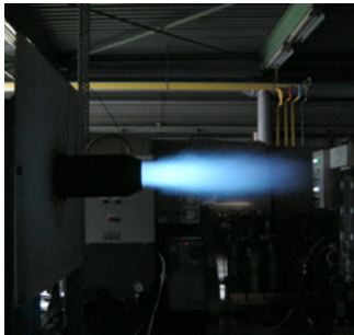
100% natural gas