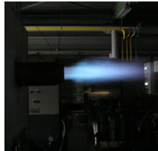
Ratio of natural gas/hydrogen 20/80