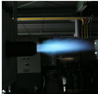
Ratio of natural gas/hydrogen 40/60