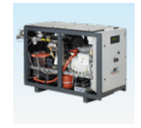
ESS works photograph