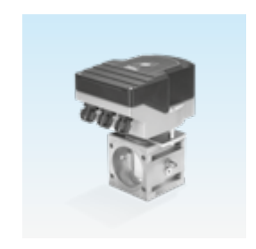
LFC with IC 20