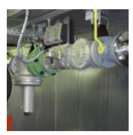
AVS works photograph