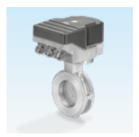
IC 20 with BV 80

Our approval in accordance with DVGW Code of Practice G 493 allows for the construction of a supply pressure control system in compliance with applicable standards.