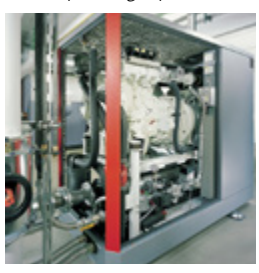
Sokratherm works photograph