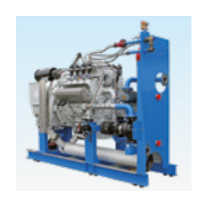
Elektro Hagl works photograph