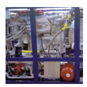
SES works photograph