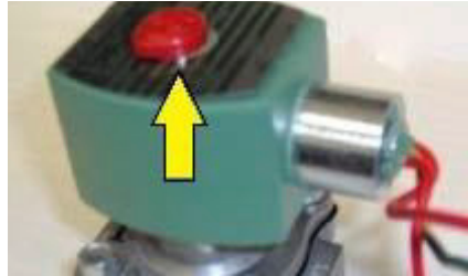
Figure 2 - Clip installed properly

Ensure that retaining rings and clips are solidly in place. Leaving these off or improperly secured, can greatly enhance the chances of the coil moving on the valve stem and overheating.