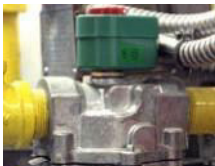
Figure 1 - Solenoid valve installed correctly

Read the literature that comes with the valve. The manufacturers recommend that for maximum useful life, they should be installed in a horizontal pipe with the stem/coil facing upward.