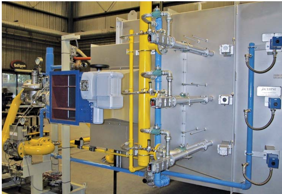
Complete RatioStar system with air and gas inlet with linked valve control.