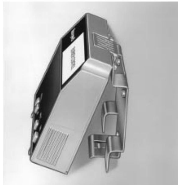
Fig. 2—Mounting the Keyboard Display Module on the Remote Mounting Bracket.

Mark the two screw locations and drill the pilot holes.