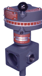
1" -O -400 SYNCHRO