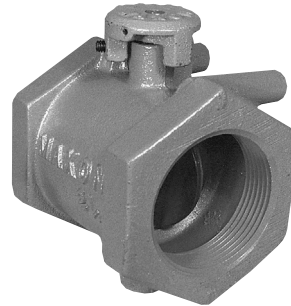
2-1/2" Series “BV” Valve

Series “BV” Balancing Valves are used to balance gas or air flows in multiple-burner systems fed by a common manifold. They feature a full-flow butterfly design with provision for locking in any position.