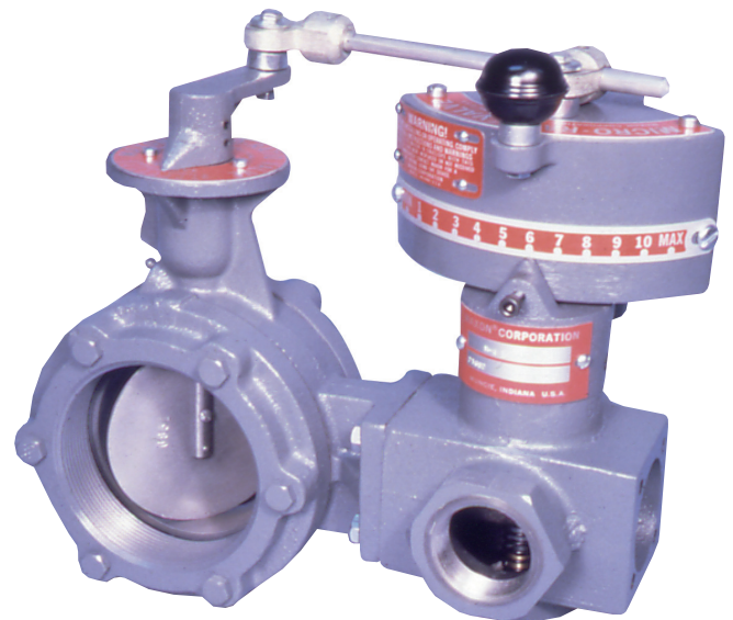
Air Gas M- 4" x 1-1/2" -P MICRO-RATIO® Valve

MICRO-RATIO® Valves covered by U.S. Patents 2,286,173; 2,035,904; and 3,706,438.