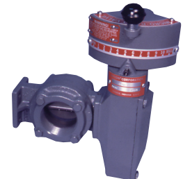
2-1/2" -M SYNCHRO Valve