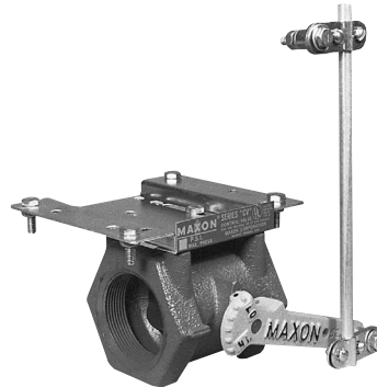
2" Series “CV” Valve with optional connecting base and linkage assembly

Versions available with UL (Underwriters Laboratories) listing for air, natural gas and liquefied petroleum gas service.