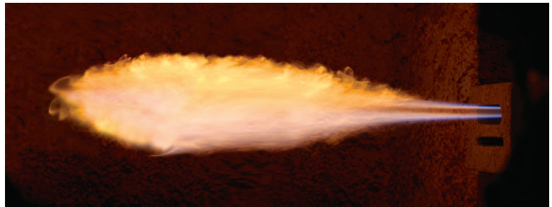
Figure 1: Oxy-Therm FHR adjustable staged oxygen, flat flame burner.

In one case, using the Brightfire 200 with an under-port firing arrangement on a large float furnace, \text{NO}_x was demonstrated to be 15% to 25% less compared to other burners on end port and side port furnaces. In another application, \text{NO}_x was reduced substantially on an end port furnace, a \text{NO}_x reduction greater than 20% was realised, achieving the goal of less than 550 \text{ mg/Nm}^3 required for the application. Fig 3 shows the Brightfire 200 with mounting bracket.