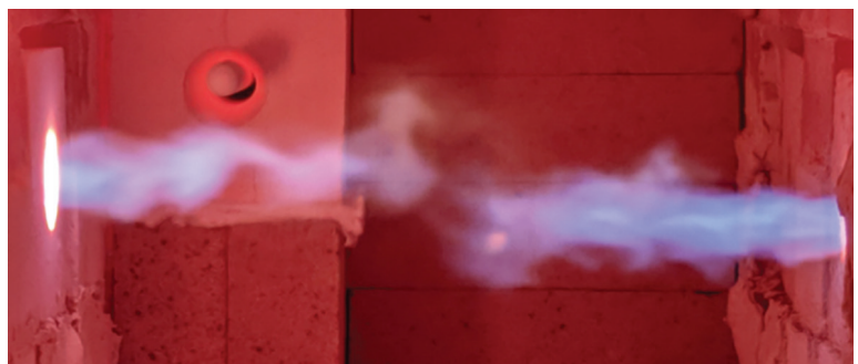
Figure 4: The latest Primefire FH forehearth technology (front right) versus the old technology (rear left).