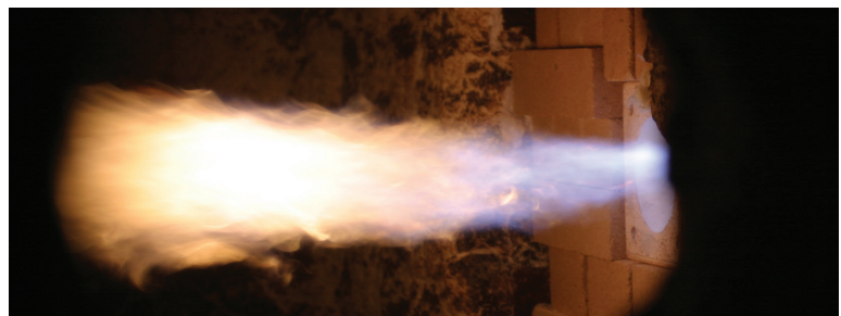
Figure 2: Oxy-Therm LE staged oxygen, conical flame burner.