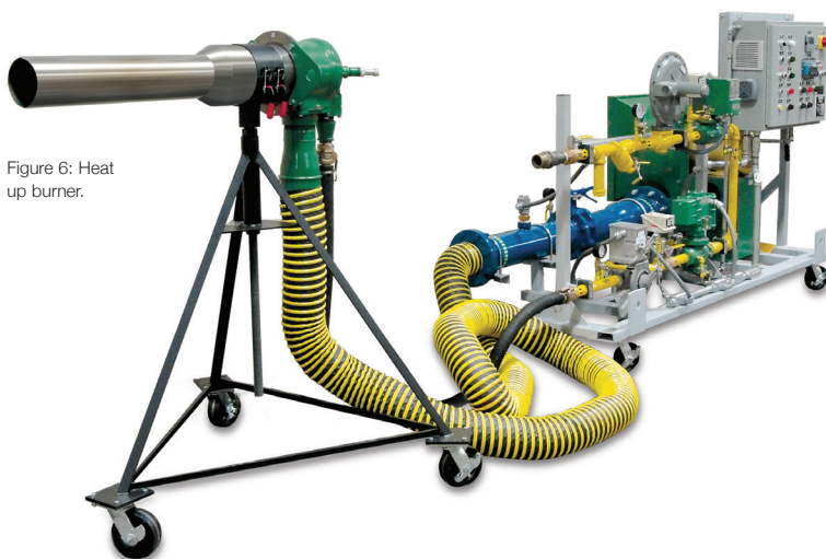
Figure 6: Heat up burner.

The correct burner/block design combination helps ensure burner performance, reduce required maintenance and improve burner/block product life. Since a forehearth application could use up to several hundred burners, it is critical to use the latest technology available to ensure the integrity of the process and quality of the product. The PrimeFire FH (figure 4) is next generation oxy-forehearth burner technology from Honeywell. It features a patent pending burner/block combination that achieves all the above-mentioned targets with zero maintenance required and up to 50% longer life than old technology. Additionally, exact emissions performance may vary, depending on application but oxy-fuel firing versus air-fuel firing has yielded an improvement of 80% in emissions reductions and 60% improvements in fuel efficiency.