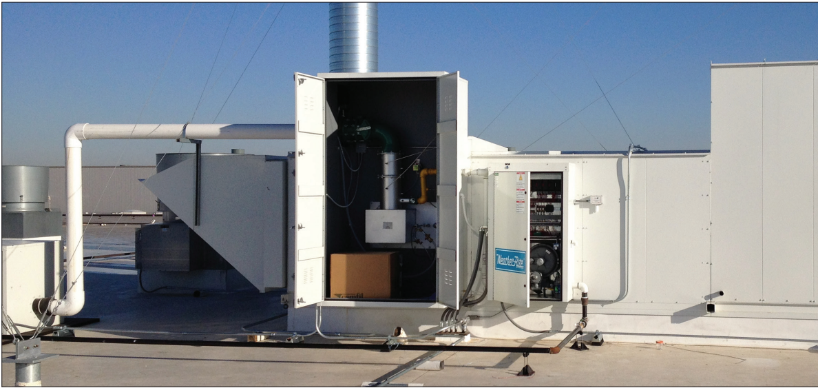
WEATHER-RITE™ make-up air handling system with Linnox ULE burner.