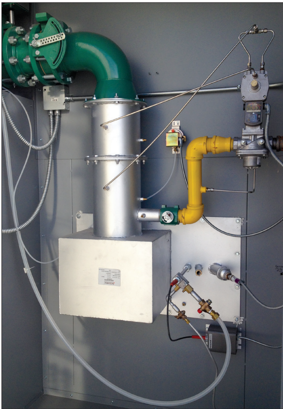
Linnox ULE burner installed inside the air handling unit.

When the air handling equipment was commissioned at the customer site, the burners were quickly tuned for optimal performance. The weather on the day of startup was mild, with an outdoor air temperature of approximately 60°F. Achieving the maximum outlet temperature of 140°F was easily accomplished, and the stable low fire performance of the Linnox ULE was demonstrated when the outlet temperature was set to the low end of 70°F. The Linnox ULE was able to heat the process air only 10 degrees, while meeting the emissions requirements.