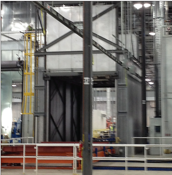
Wash and paint system for locomotive cabs.