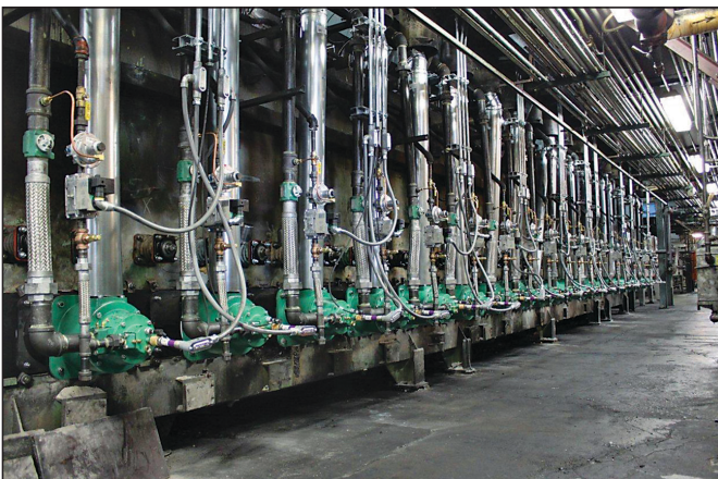
Furnace after conversion with Eclipse 8" SER v5 burners.

The Eclipse team reviewed the site and discovered that the existing tube firing burners and U tubes could be replaced with the same number of Eclipse SER v5 800 Self-Recuperative Single-Ended Radiant Tube Burners. The customer requested that a limited scope test in the Minneapolis plant be completed before moving ahead with the full furnace conversion.