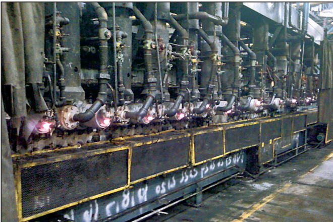
Furnace before conversion with tube firing burners and U tubes.

There were several issues surrounding the existing tube firing burners and 6" U tubes in Bedford Park, including higher temperatures due to exposed sections of the radiate tube and glow pilot. There were also leakage issues between the burner and recuperator, causing a short U tube life. In addition, the burners were heavy and difficult to handle during maintenance.