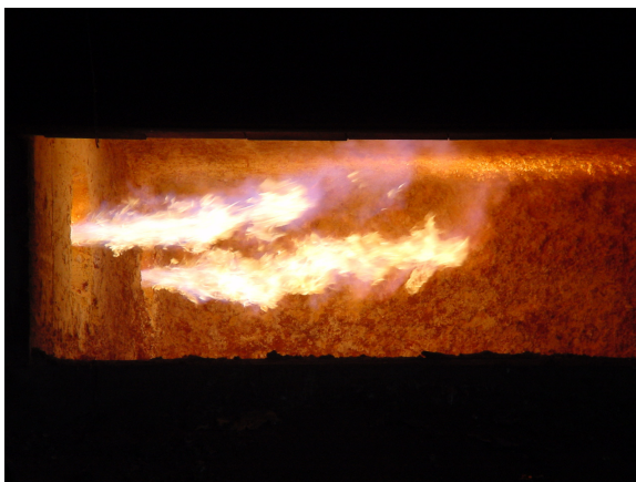
Inside one of the chambers of the aluminum melter

Due to the operation of the two chambers and the requirement for independent firing systems, each was equipped with safety shut-off valves, pilot burners and UV sensors for flame detection. The first chamber uses Eclipse Primefire 100 burners and the second chamber uses Eclipse Primefire 300 burners. Both Primefire 100 and 300 burners operate at 1.4MMBTU and use LPG as a fuel and LOX (liquid oxygen) as a source of oxygen.