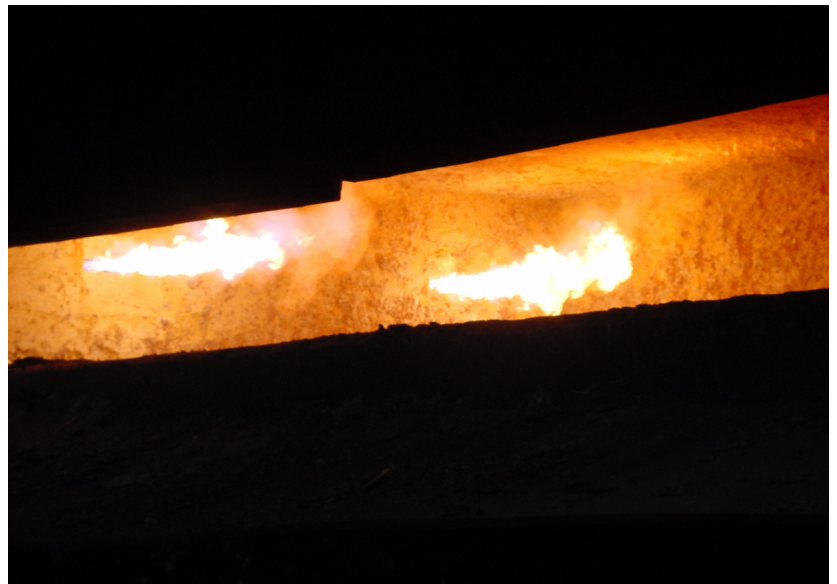
An Internal view of the firing chamber