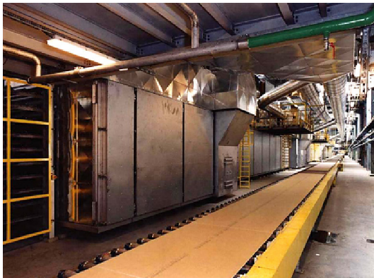
BPB longitudinal dryer

This specification will be the base for all future revamps and extensions with this type of gas burners.