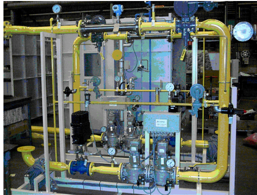
Order BPB Thailand