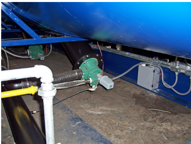
Two of four Eclipse ThermJet (TJ0300) burners firing around the rotary drum.