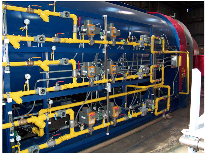
Dual valve trains on rotary drum unit.