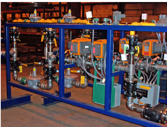
Dual valve trains for each burner can supply natural or digester gas.