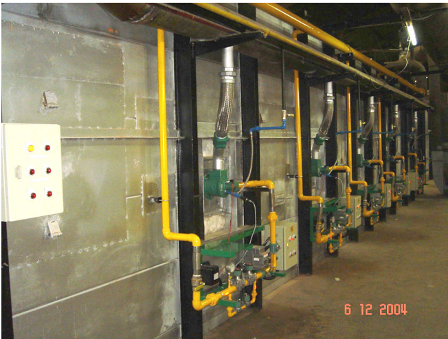
System in operation