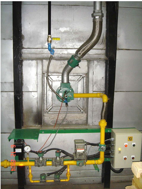
Closeup of burner and valve train