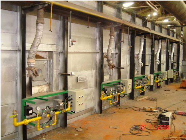
System during installation