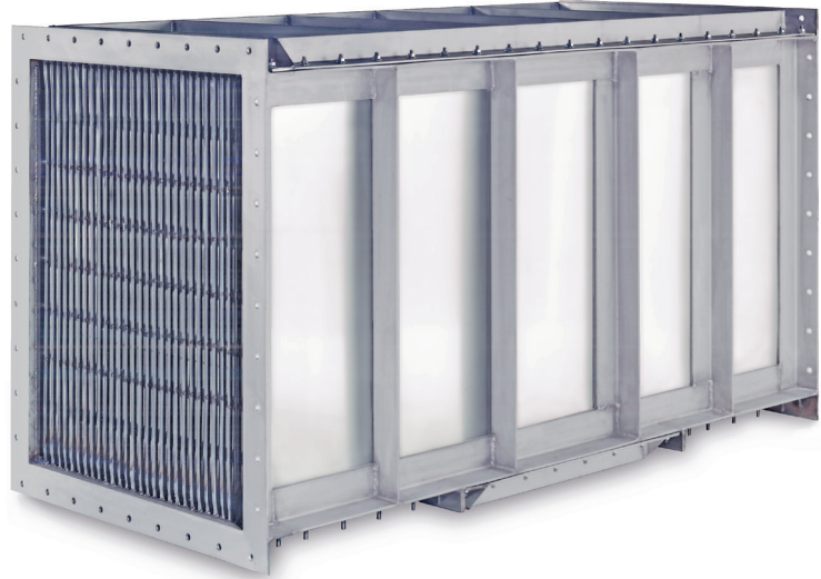
“SP” model heat exchanger featuring access covers

High heat transfer effectiveness is achieved by corrugating the heat transfer plates to achieve our exclusive sinusoidal wave pattern. The corrugated surfaces create air flow turbulence as the air passes through the unit. Heat transfer is further enhanced by using a counterflow design.