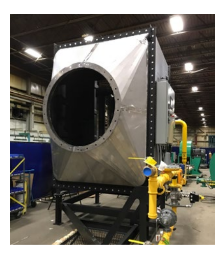
Maxon Packaged Burner System for Agricultural Drying Application in US. Commissioned in 2019.