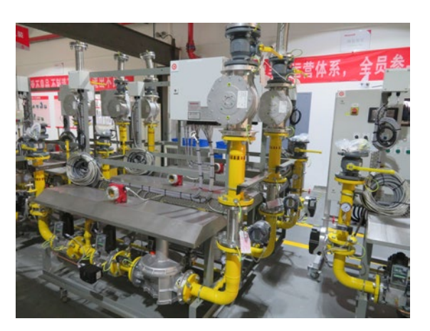
Eclipse Packaged Burner System for Heating Process Exhaust Application in China. Commissioned in 2017.