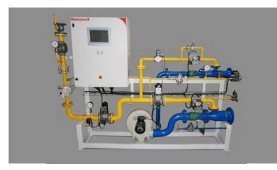
Eclipse Packaged Burner System for Paper Drying Application in Portugal. Commissioned in 2020.