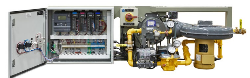
Maxon OVENPAK® LE System Standardized Solution Package. Low cost, short lead time.

Every company must deal with changing trends in safety, codes, and standards compliance and government regulations. At the same time, controlling process variables is a meticulous business. Perfecting those abilities within a production facility is a crucial task, one that requires innovative thermal process control technology and domain expertise.