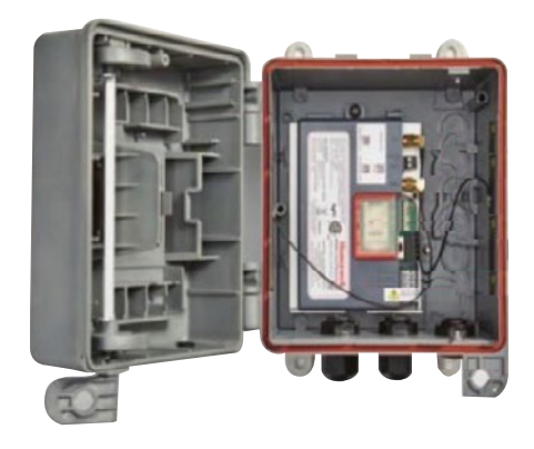
Thermal IQ Composite Case