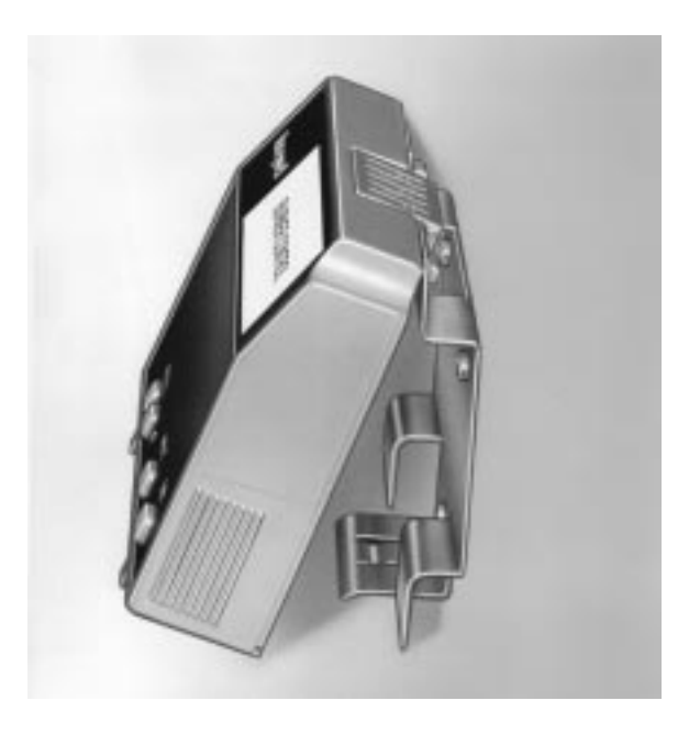
Fig. 2—Mounting the Keyboard Display Module on the Remote Mounting Bracket.

Mark the two screw locations and drill the pilot holes.