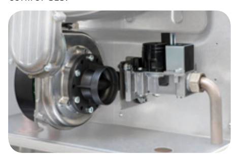
Fan BL with mixer and adapter on combination control CES in the boiler

The optional mixer and adapter enable the fan to be installed direct on the combination control CES.