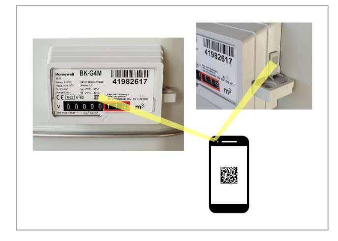
Illustration of the operating principle: