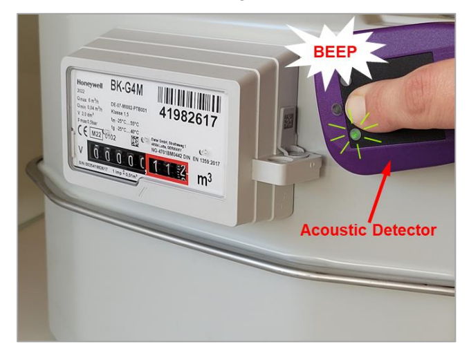
Illustration of the operating principle:

If further evidence is needed, this can be supported on request.